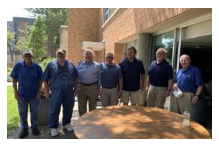
Men in Blue from Savvy Seniors group